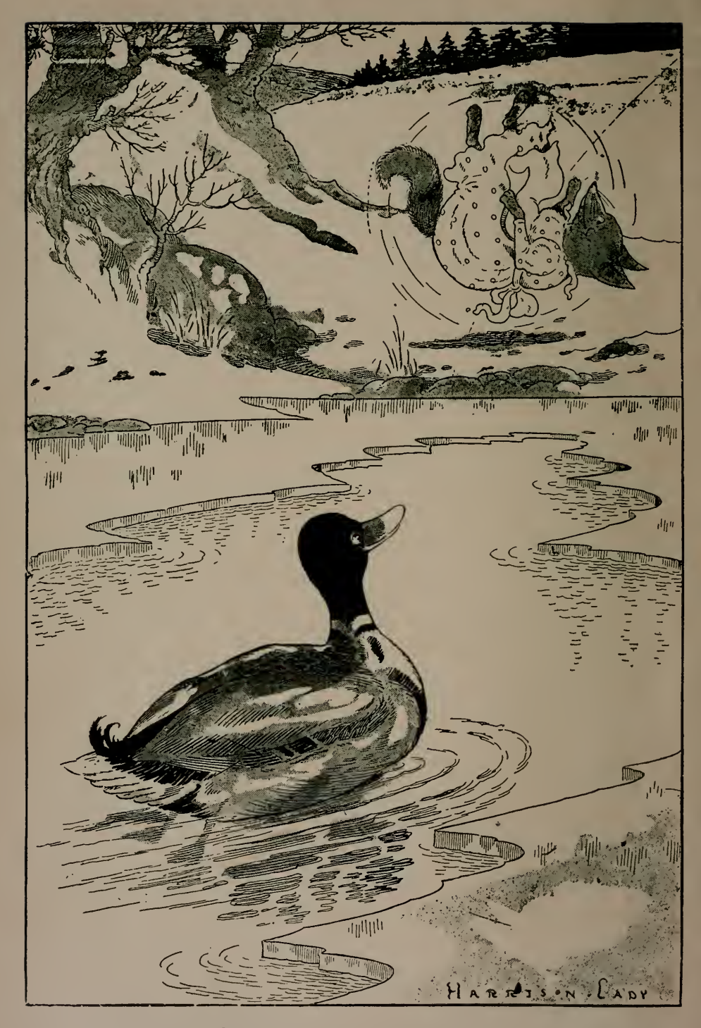
All the time Granny was cutting up her antics. Page 26.